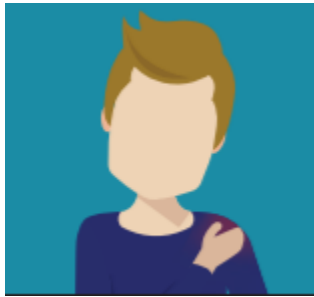
Pain and swelling of the arm